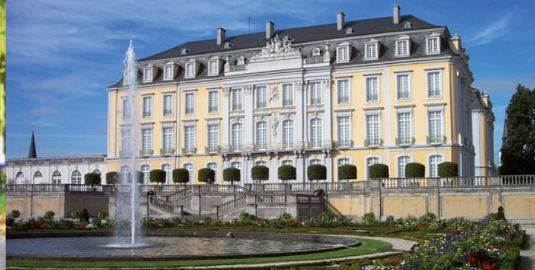
Augustusburg Palace, UNESCO World Cultural and Natural Heritage Site