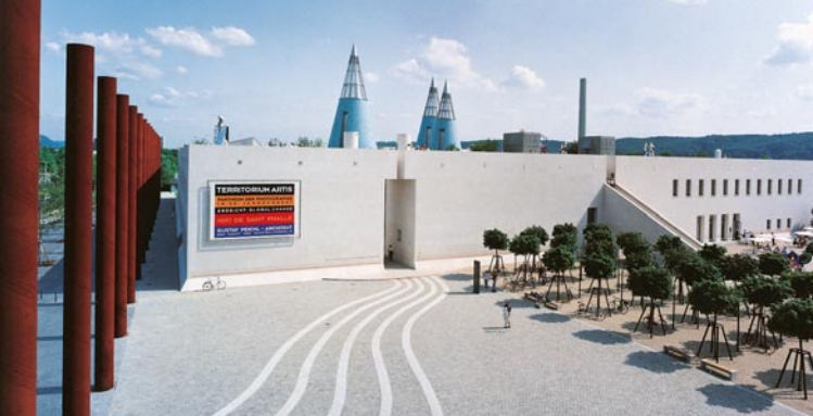
Art and Exhibition Hall