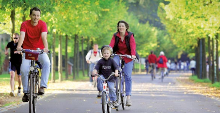
Cycling Tour in Bonn