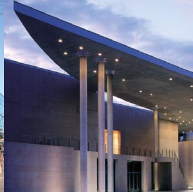
Kunstmuseum Bonn (Museum of Modern Art)