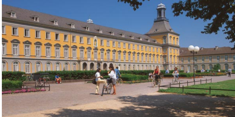
University of Bonn