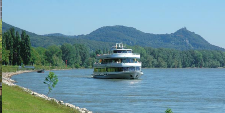
Cruise on the Rhine