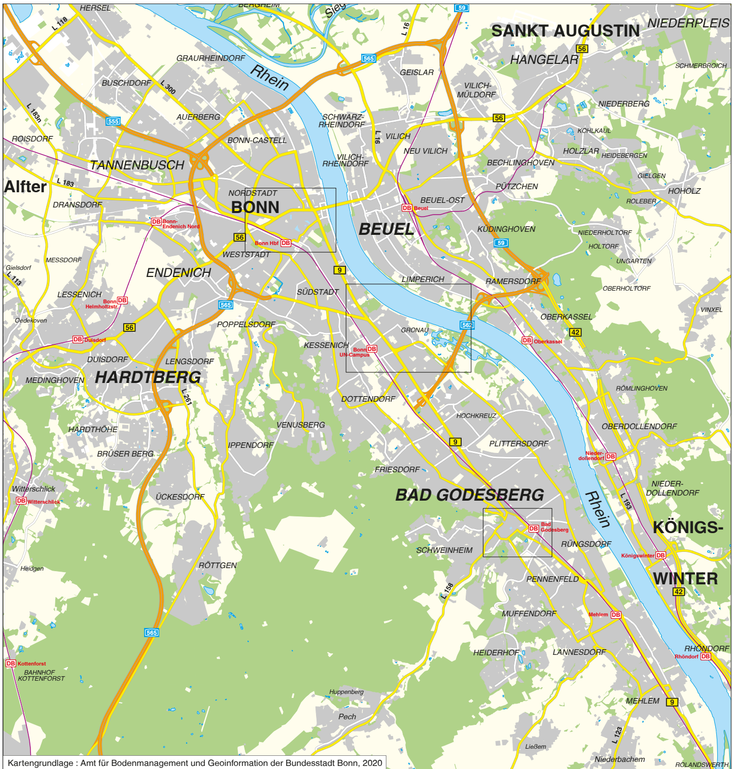
Kartengrundlage : Amt für Bodenmanagement und Geoinformation der Bundesstadt Bonn, 2020