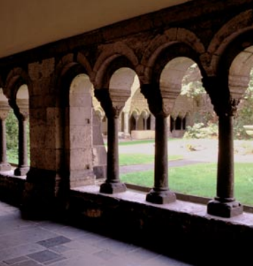
Minster Basilica Cloister