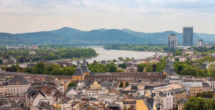
Bonn on the Rhine