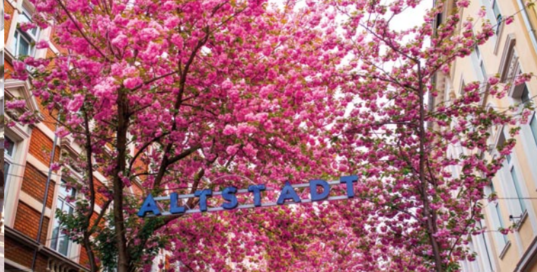
Cherry Blossom Altstadt (Old Town)